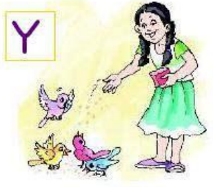
feed the birds