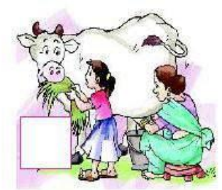
help to milk a cow