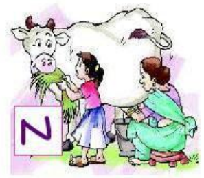
help to milk a cow