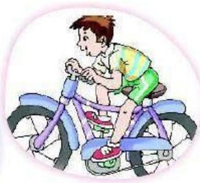
Riding a bicycle