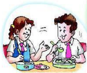
Sharing with friends