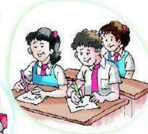
Studying in class