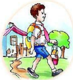
Going to school