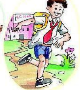
Returning from school