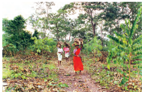
Fig.6 - Women returning home after collecting fuelwood.