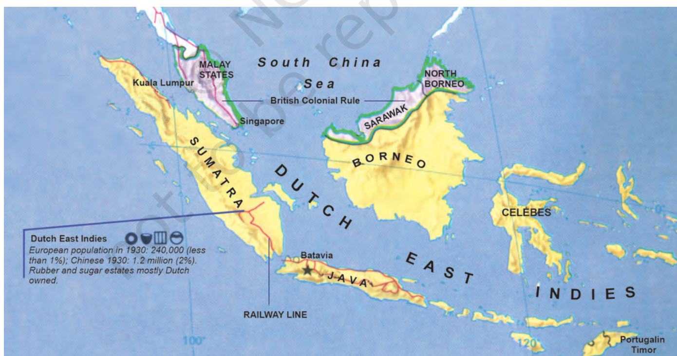
Fig. 22 – Most of Indonesia's forests are located in islands like Sumatra, Kalimantan and West Irian. However, Java is where the Dutch began their 'scientific forestry'. The island, which is now famous for rice production, was once richly covered with teak.

Dirk van Hogendorp, cited in Peluso, Rich Forests, Poor People , 1992.