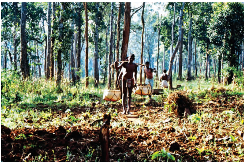
Fig. 14 – Bringing grain from the threshing grounds to the field.

The men are carrying grain in baskets from the threshing fields. Men carry the baskets slung on a pole across their shoulders, while women carry the baskets on their heads.