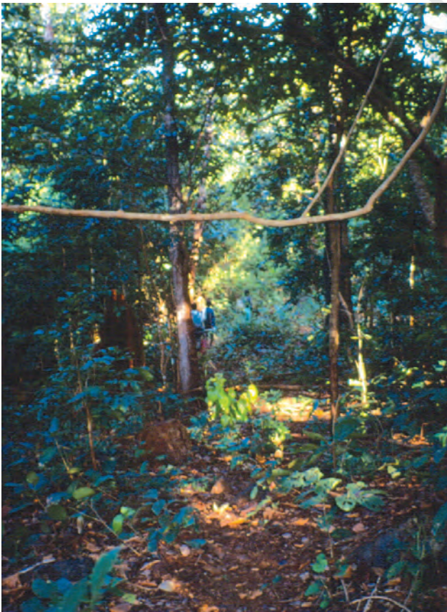
Fig. 1 – A sal forest in Chhattisgarh.

A lot of this diversity is fast disappearing. Between 1700 and 1995, the period of industrialisation, 13.9 million sq km of forest or 9.3 per cent of the world's total area was cleared for industrial uses, cultivation, pastures and fuelwood.