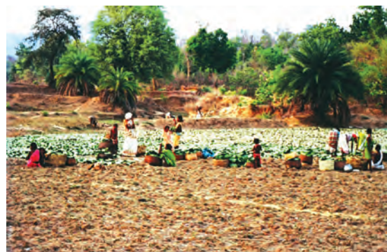
Fig. 13 – Drying tendu leaves.

The Forest Act meant severe hardship for villagers across the country. After the Act, all their everyday practices – cutting wood for their