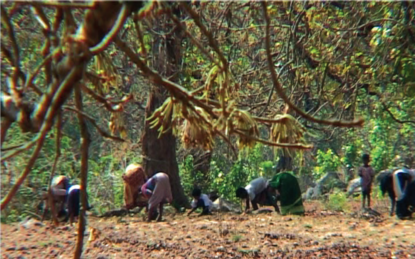
Fig. 12 – Collecting mahua ( Madhuca indica ) from the forests.

Villagers wake up before dawn and go to the forest to collect the mahua flowers which have fallen on the forest floor. Mahua trees are precious. Mahua flowers can be eaten or used to make alcohol. The seeds can be used to make oil.