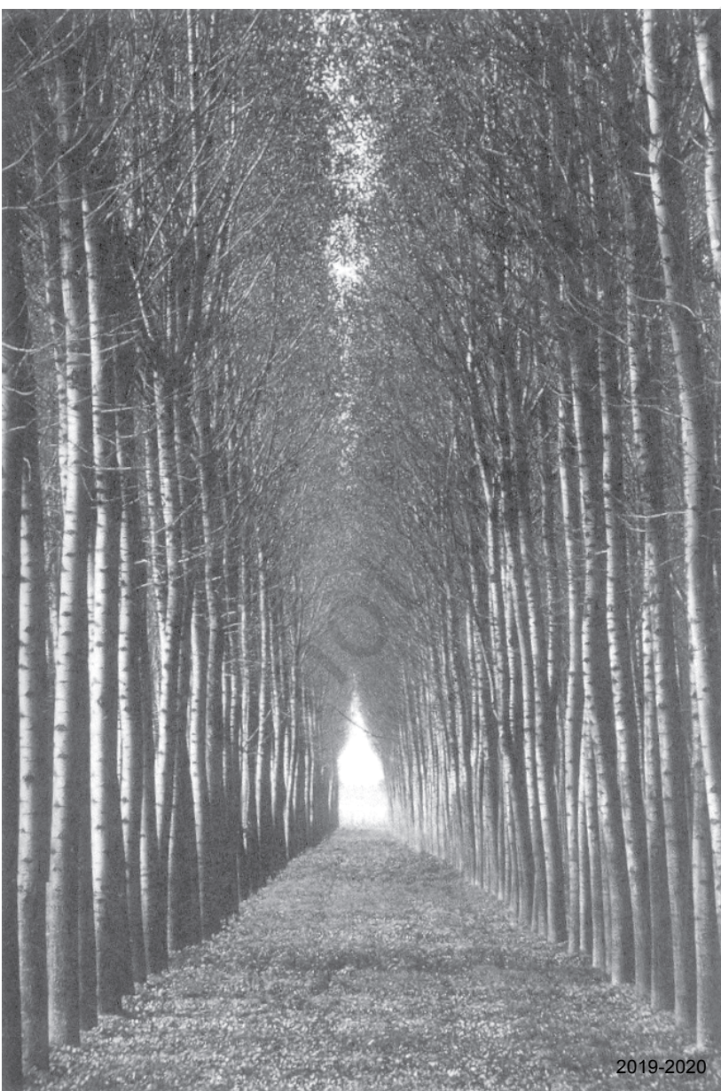
Fig.9 – One aisle of a managed poplar forest in Tuscany, Italy.

If you were the Government of India in 1862 and responsible for supplying the railways with sleepers and fuel on such a large scale, what were the steps you would have taken?