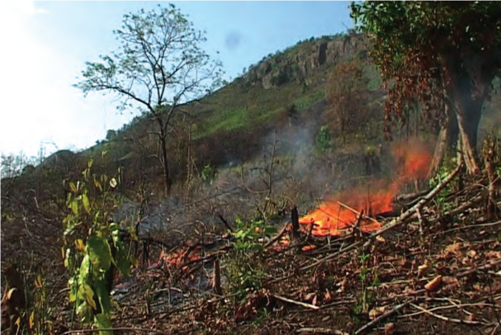
Fig. 16 – Burning the forest penda or podu plot.

In shifting cultivation, a clearing is made in the forest, usually on the slopes of hills. After the trees have been cut, they are burnt to provide ashes. The seeds are then scattered in the area, and left to be irrigated by the rain.