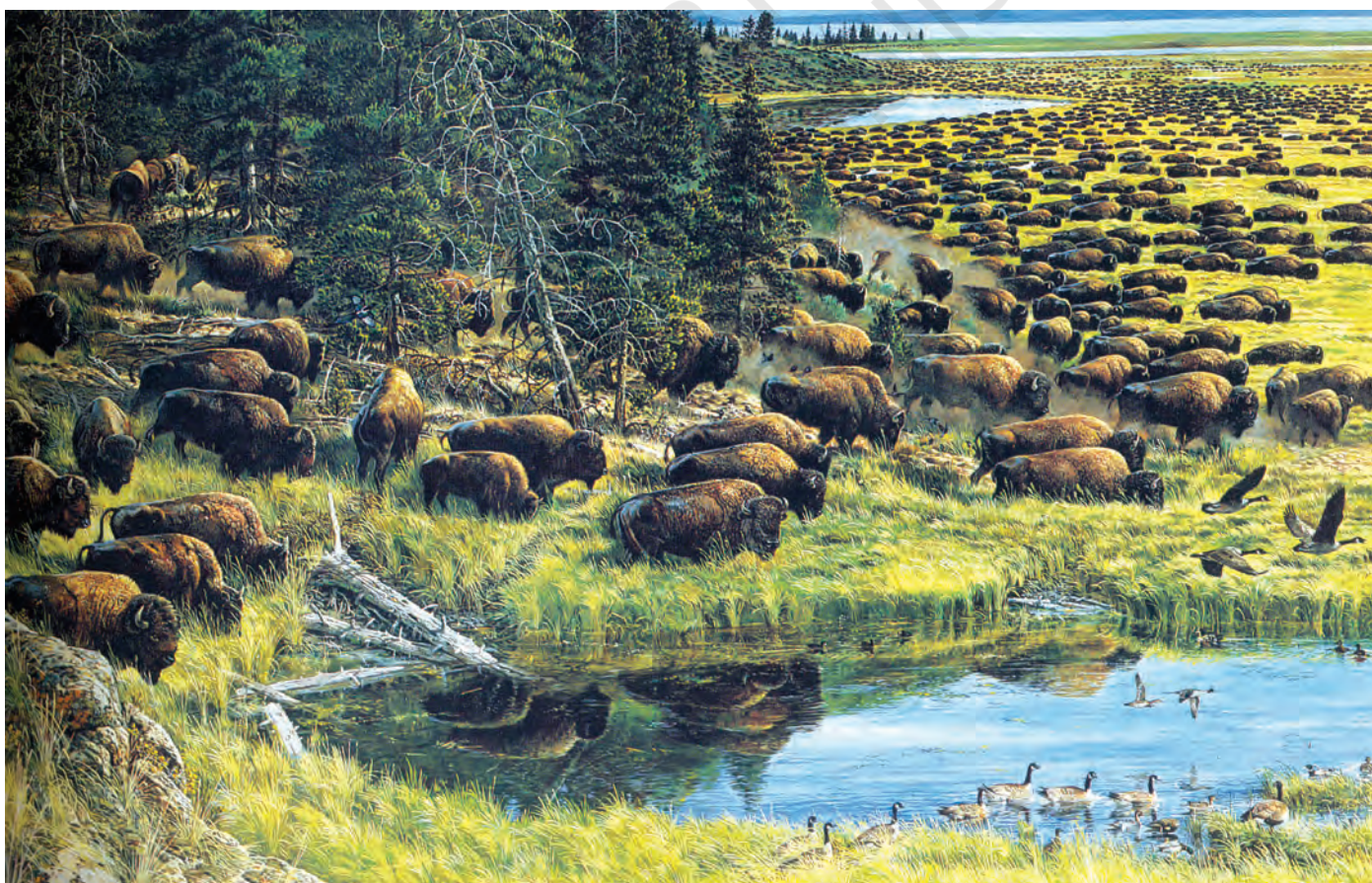
Fig.2 – When the valleys were full. Painting by John Dawson.

In 1600, approximately one-sixth of India's landmass was under cultivation. Now that figure has gone up to about half. As population increased over the centuries and the demand for food went up, peasants extended the boundaries of cultivation, clearing forests and breaking new land. In the colonial period, cultivation expanded rapidly for a variety of reasons. First, the British directly encouraged