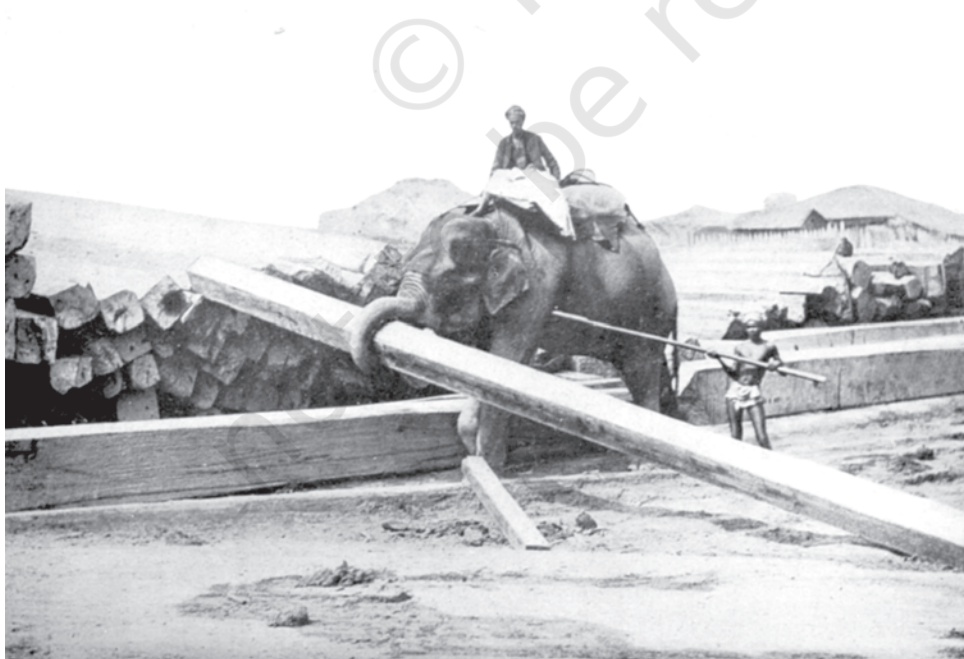
Fig.5 – Elephants piling squares of timber at a timber yard in Rangoon. In the colonial period elephants were frequently used to lift heavy timber both in the forests and at the timber yards.