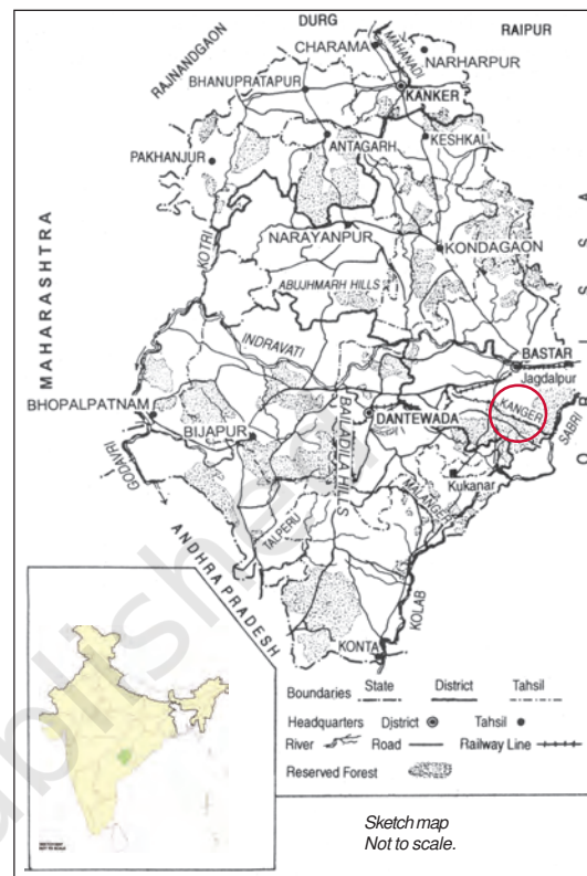
Fig.20 – Bastar in 2000.

This photograph of an army camp was taken in Bastar in 1910. The army moved with tents, cooks and soldiers. Here a sepoy is guarding the camp against rebels.