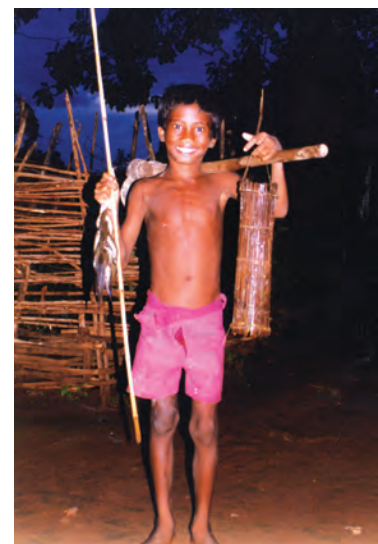
Fig. 17 – The little fisherman.

While the forest laws deprived people of their customary rights to hunt, hunting of big game became a sport. In India, hunting of tigers and other animals had been part of the culture of the court and nobility for centuries. Many Mughal paintings show princes and emperors enjoying a hunt. But under colonial rule the scale of hunting increased to such an extent that various species became almost extinct. The British saw large animals as signs of a wild, primitive and savage society. They believed that by killing dangerous animals the British