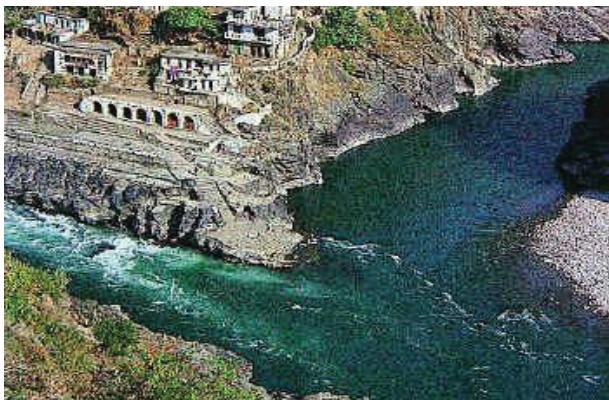
Figure 3.5 : Confluence of Bhagirathi and Alaknanda at Devprayag

The Ganga is joined by many tributaries from the Himalayas, a few of them being major rivers, such as the Yamuna, the Ghaghara, the Gandak and the Kosi. The river Yamuna rises from the Yamunotri Glacier in the Himalayas. It flows parallel to the Ganga and as a right bank tributary meets the Ganga at Allahabad. The Ghaghara, the Gandak and the Kosi rise in the Nepal Himalaya. They are the rivers, which flood parts of the northern plains every year, causing widespread damage to life and property, whereas, they enrich the soil for agricultural use.